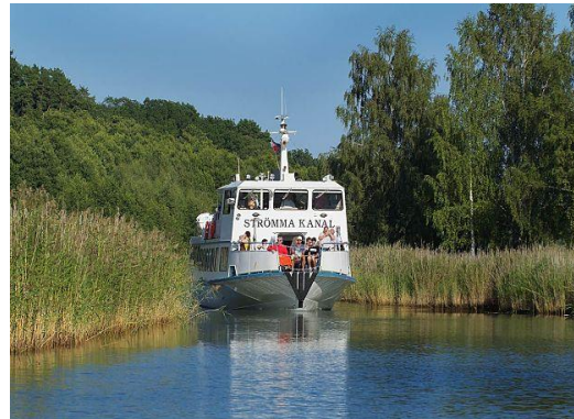
The Boat – M/S Strömma Kanal