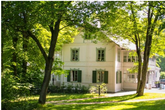
The Venue by the Sea - Ulrikdals Wårdshus