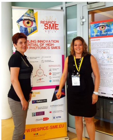
The RespiceSME workshop for aligning innovation with education at the Laser World of Photonics 2017 event

The three major Photonics Pilot Lines which help SMEs take photonics technologies from lab into market, were in attendance. PIXAPP, MIRPHAB and PIX4life, who have the capacity to help thousands of high tech SMEs in Europe who lack access to the expertise needed to manufacture new and innovative products, taking their ideas, scaling them up and validating them for commercial production, were present in hall A3.